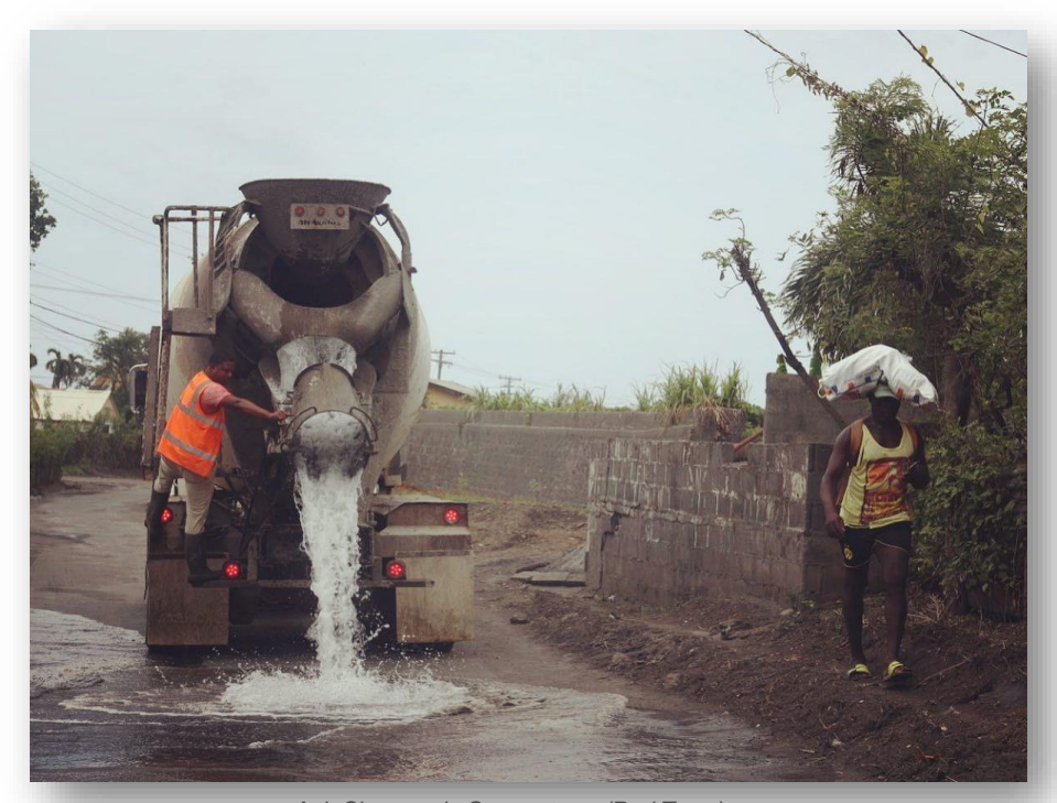
Ash Clean up in Georgetown (Red Zone)

Teams of health personnel visit the shelters daily to administer COVID-19 vaccinations and tests and carry out syndromic surveillance (Coughs, Fevers, and Diarrhoea); none of these three symptoms were reported.<sup>1</sup>