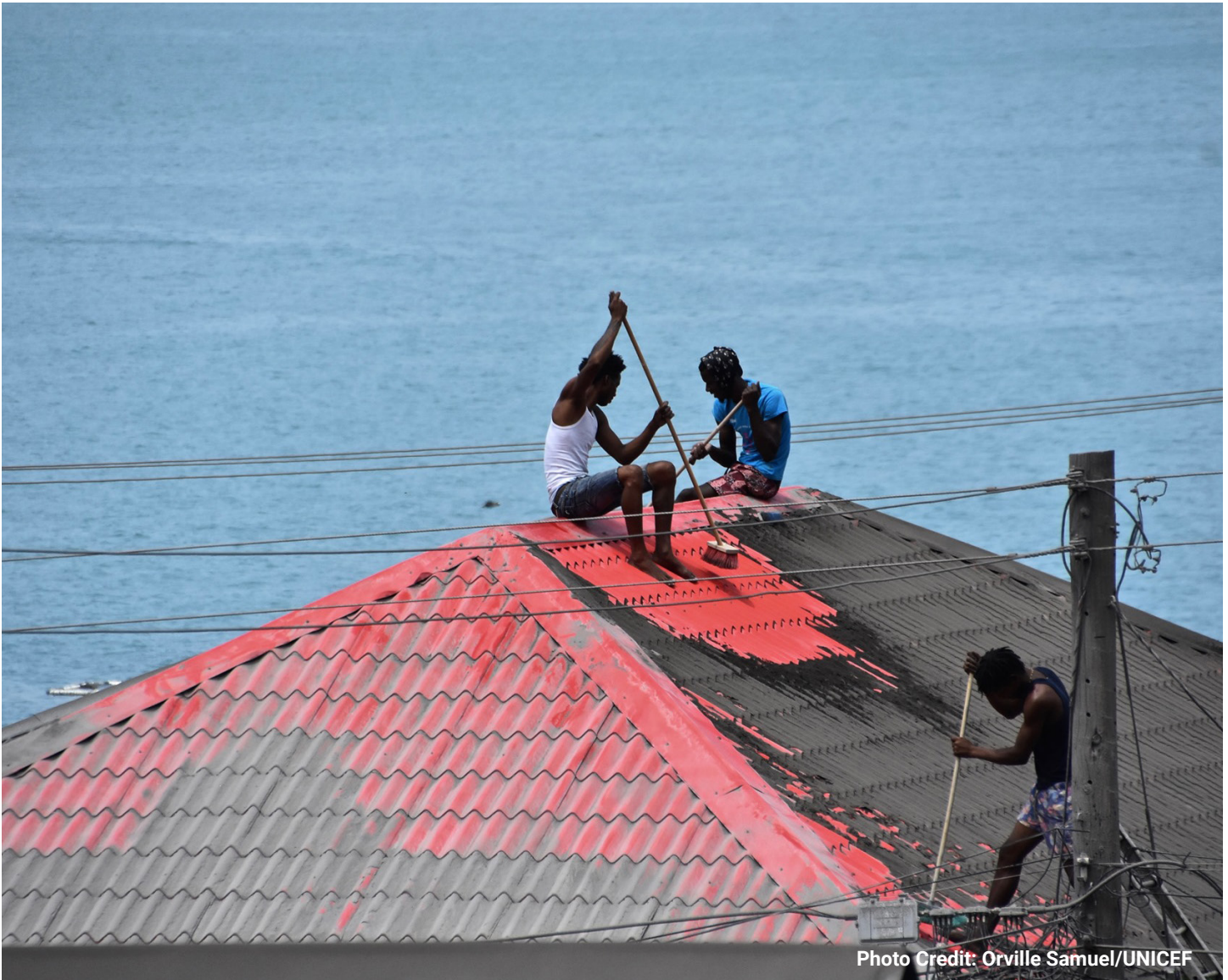
Residents of Saint Vincent and the Grenadines cleaning ash from the rooftop

Already affected by the pandemic, food security and nutrition are likely to continue deteriorating due to the loss of livelihoods, decreased access to food, crop and livestock losses, and logistics bottlenecks affecting incoming shipments to the island. The UN System will focus on activities to support Government efforts, as needed, in procuring and distributing vouchers in the event that lack of access becomes a barrier for affected people. Technical and financial support will be provided to the Government to effectively coordinate, design, and implement in-kind and multi-purpose cash transfers, with a gender and child responsive focus, aimed at meeting the basic needs of affected people, whether for food or non-food items or access to basic services, leveraging the social protection system. The significant levels of in-kind food and other relief items anticipated to arrive in the country in the coming days and weeks can potentially create bottlenecks.