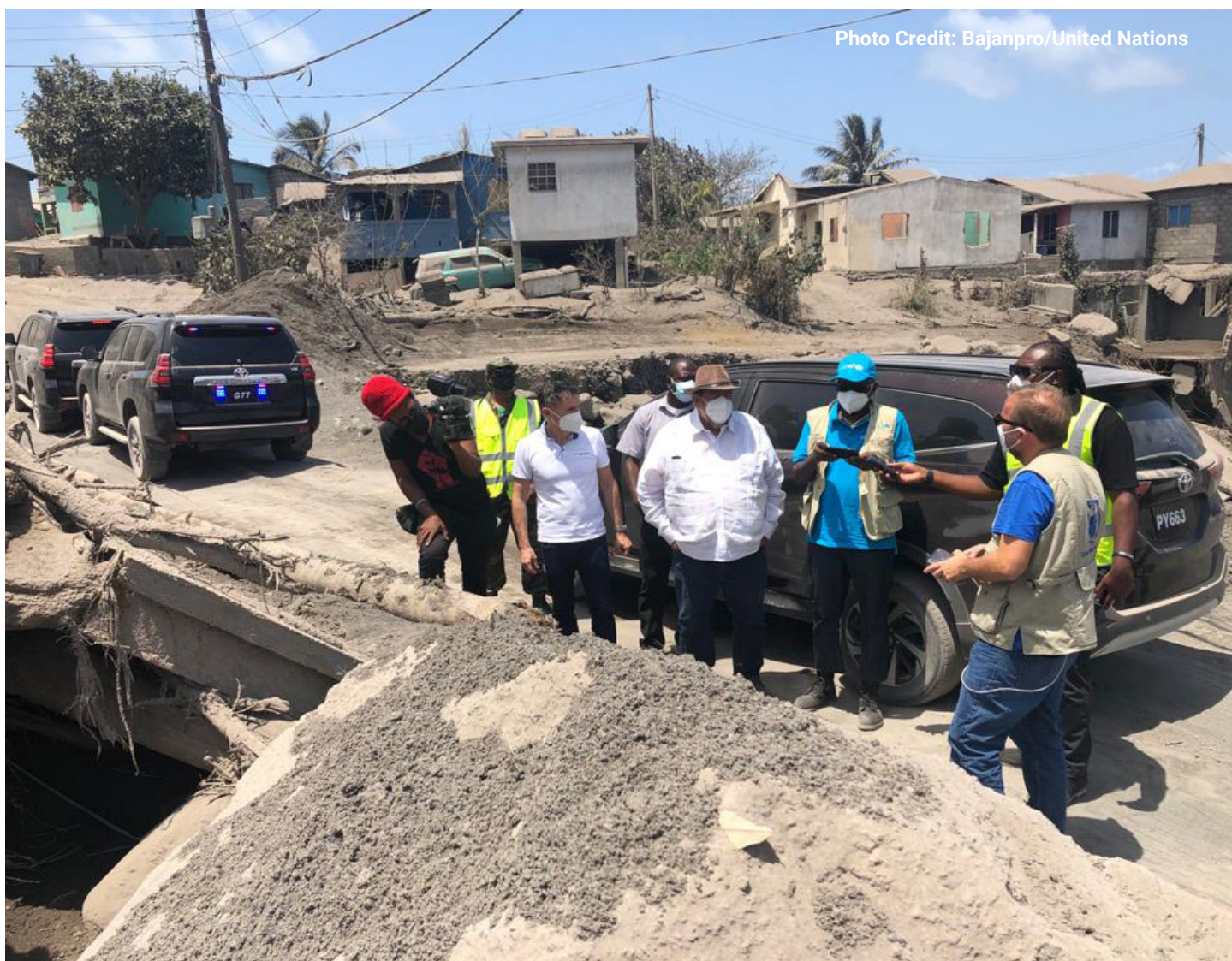
The UN Sub-regional Team in the red zone assessing the impact with Hon Prime Minister Dr. Ralph Gonsalves

In order to avoid duplication of efforts and facilitate better coordination, OCHA's Who does What, Where, When and for Whom (345W) online system could be utilized to report activities and monitor progress, enabling synergies to be more easily identified to make sure that the support provided is well-targeted and efficient.